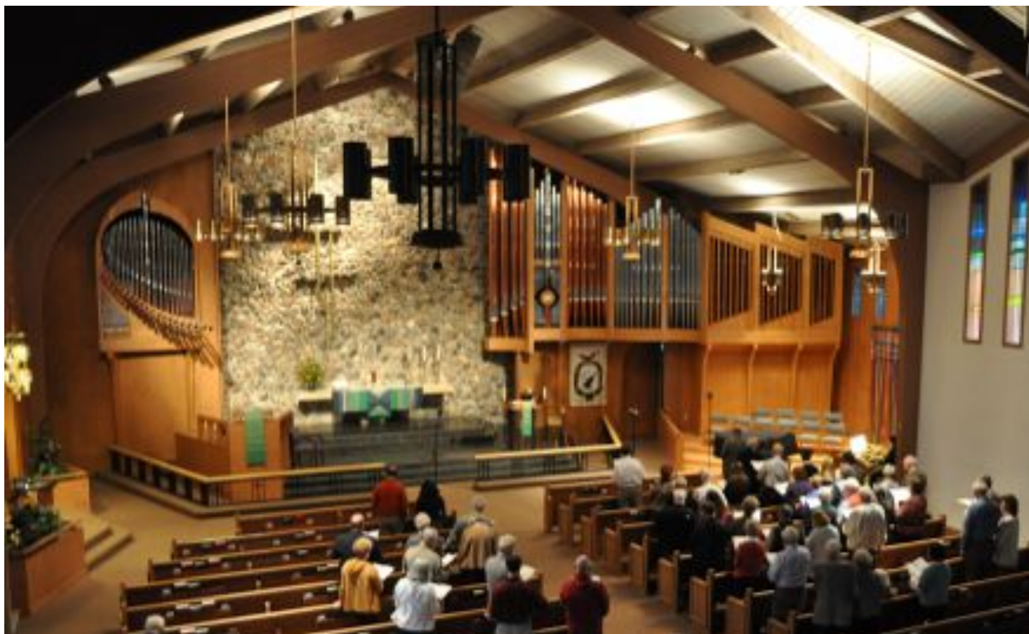
Hymn Festival at Messiah Lutheran Church, Redwood City

We advertised this event with other AGO chapters and in the Redwood City and Palo Alto events guides— and were excited to have over 50 persons attending the event. Organists in attendance were given a packet of the compositions to try on their own.