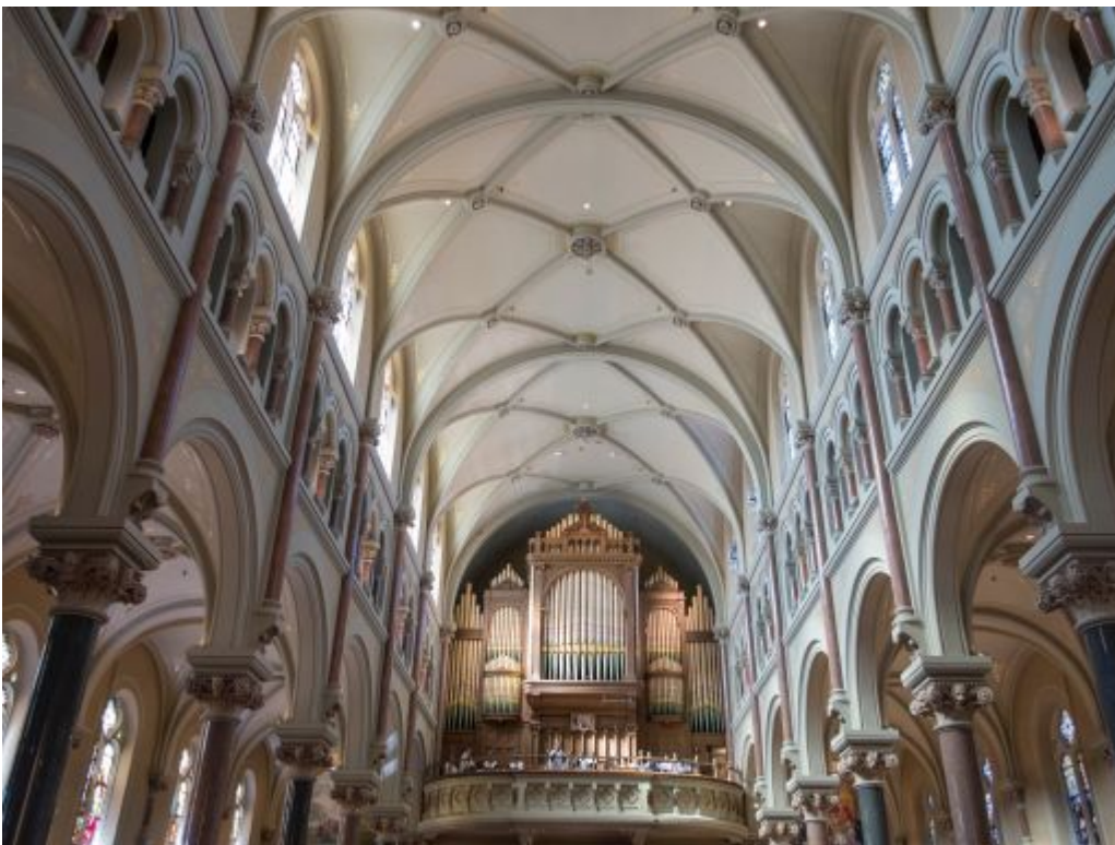
Basilica of Our Lady of Perpetual Help (Mission Church) George S. Hutchings Op. 140, 1897