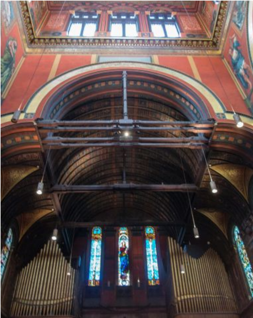
Trinity Church in the City of Boston Skinner Organ Co. Op. 573, 1926 Aeolian-Skinner Op. 573-C, 1961