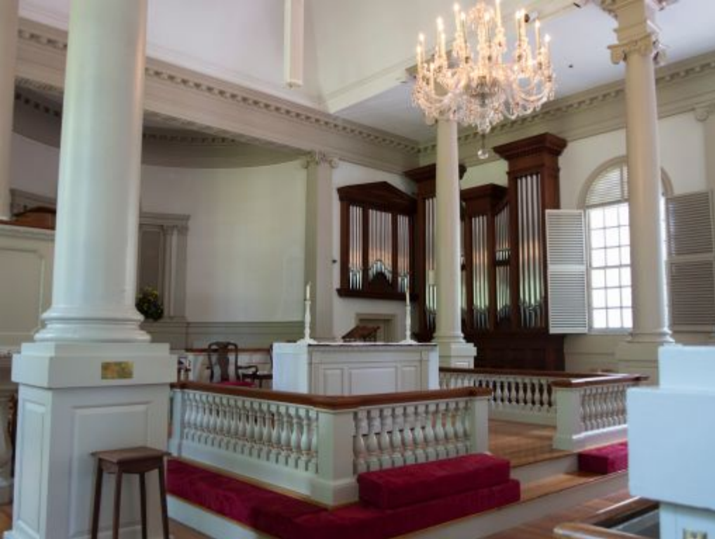
Christ Church, Cambridge Schoenstein & Co. Op. 149, 2006