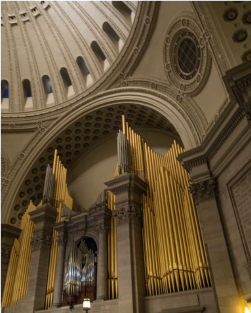
First Church of Christ, Scientist, "The Mother Church" Aelian Skinner Op. 1203, 1952