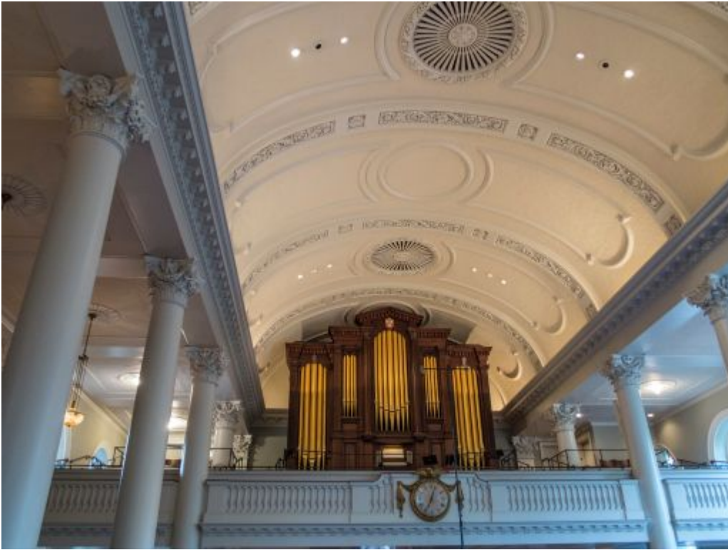
Memorial Church, Harvard University C.B. Fisk Op. 139, 2012