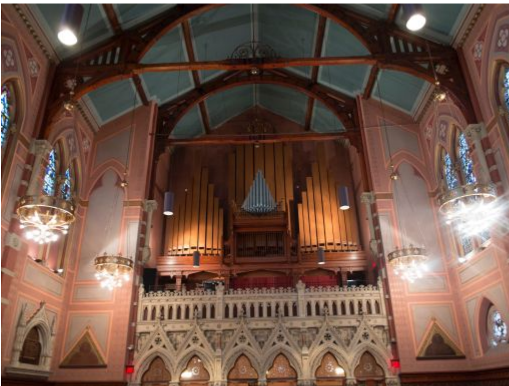
Old South Church Skinner Organ Co. Op. 308, 1921