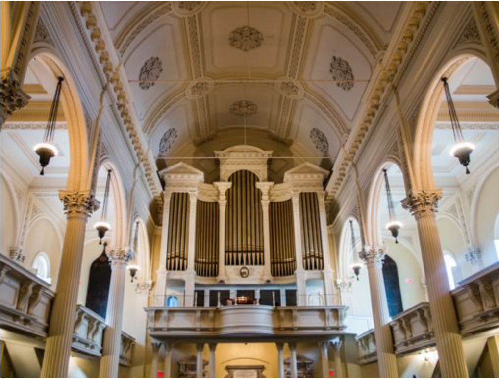
Arlington Street Church Aeolian-Skinner Op. 1307, 1958