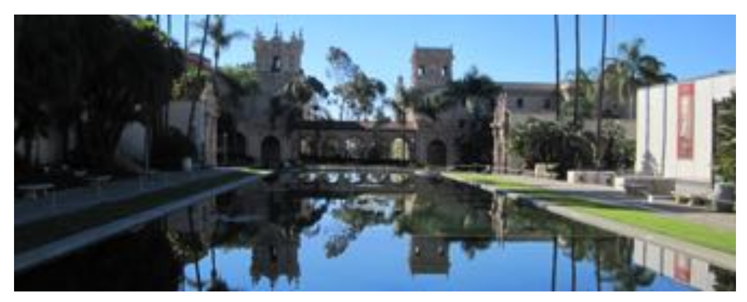
AGO West Region Convention in San Diego June 28-July 2, 2015 Register now before prices go up on May 31!

Registration prices will soon go up for the West Region Convention. Come join the party everyone will be talking about as we celebrate 100 years of the famed Spreckels Organ. You will also be treated to a sampling of phenomenal instruments from all across San Diego County, and enjoy concerts and workshops given by top artists from the West Region. Stay a few extra days and discover why San Diego is "America's Finest City". Visit www.agosandiego2015.org for all of the details and to register.