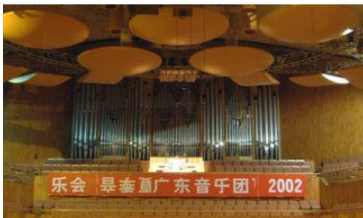
Rieger-Kloss Organ, Xinghai Concert Hall; Guangzhou