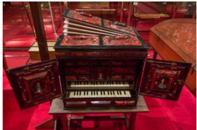
Clavierorganum from ca. 1620; Macau

DU: As of today, there are 189 pipe organs in the Census, dating from 1600 to 2019. There are further instruments under construction of which I am aware, and some reports of historic organs that are not verifiable (at least at present). The Project is firmly dedicated to the pipe organ, and does not generally cover hybrid or electronic instruments, or the reed organ/harmonium.