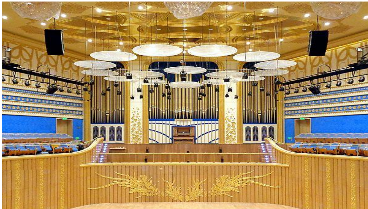
2014 Klais Organ, Linyi Grand Theater